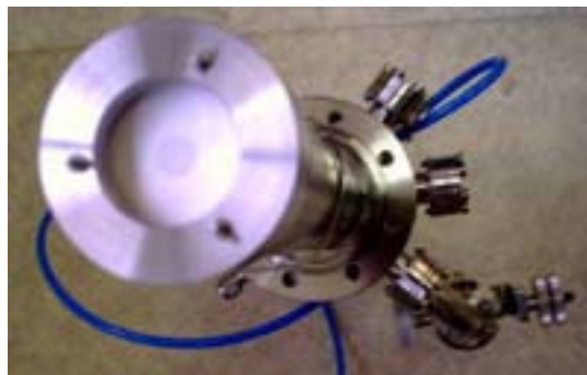
special Atom aperture for reduced flux/small samples