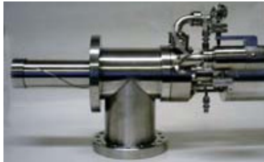
Plasma Source with differential pumping for high pressure operation