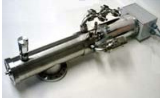
Plasma Source with differential pumping for low pressure operation and with shutter