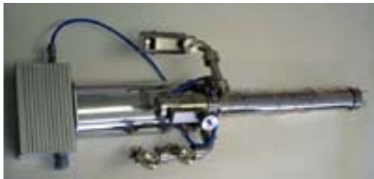
Elongated version with second gas inlet