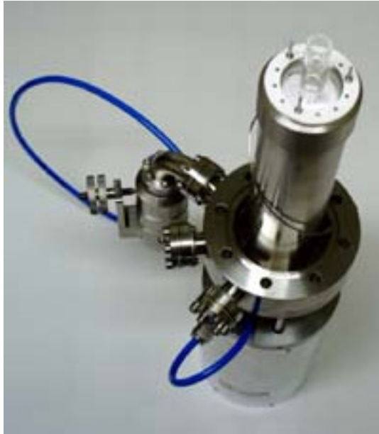
Atom aperture with quartz collimator tube special Atom aperture for reduced flux/small samples